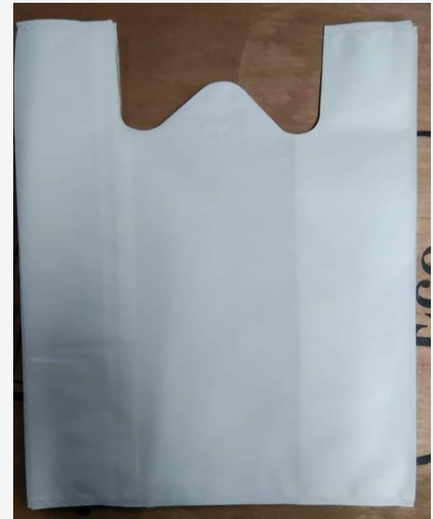
6 WHITE W CUT Price: INR 135 PER KG