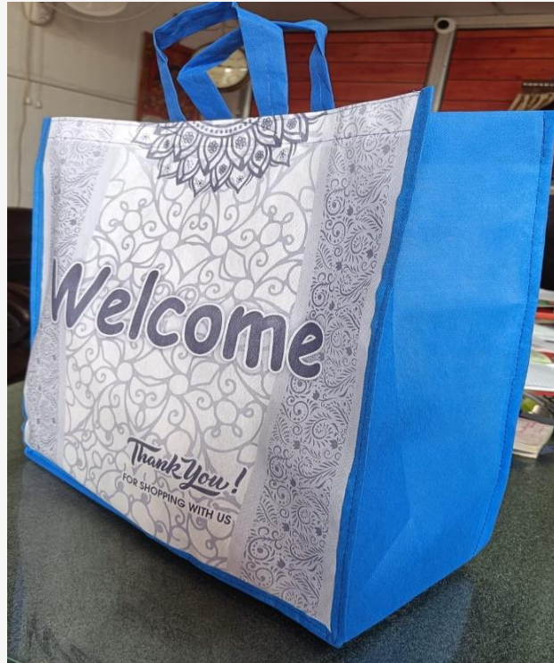
10 WELCOME STITCHING BAG Price: INR 10 PER PCS