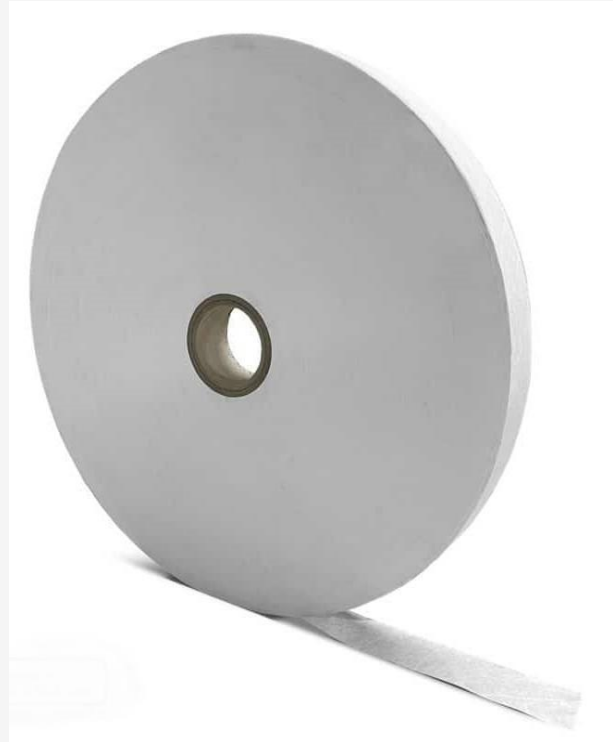
11 2" PATTI WHITE Price: INR 130 PER KG