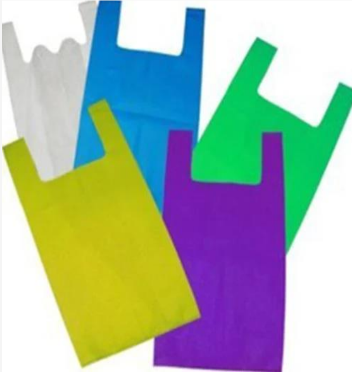
13 U CUT PLANE Price: INR 135 PER PCS