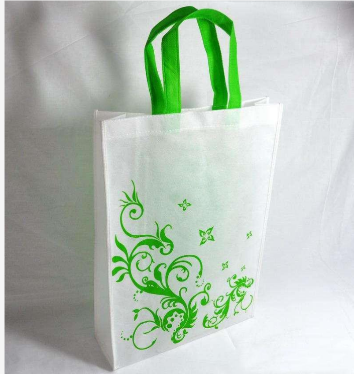
14 STITCHING BAG Price: STARTING FROM INR 10