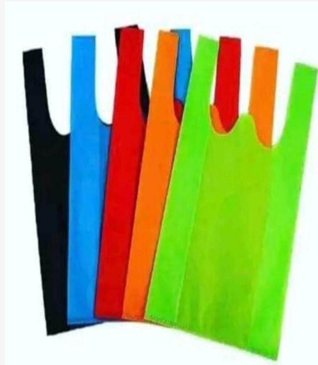
5 TAJ W CUT Price: INR 120 PER KG