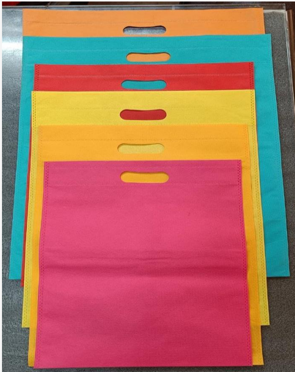
4 D CUT COLORED (GOLDEN YELLOW, LEMON YELLOW, RED, PINK, ORANGE, R GREEN) Price: INR 135 PER KG