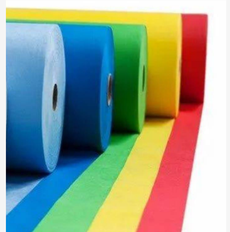
12 2' PATTI COLORED Price: INR 135 PER KG