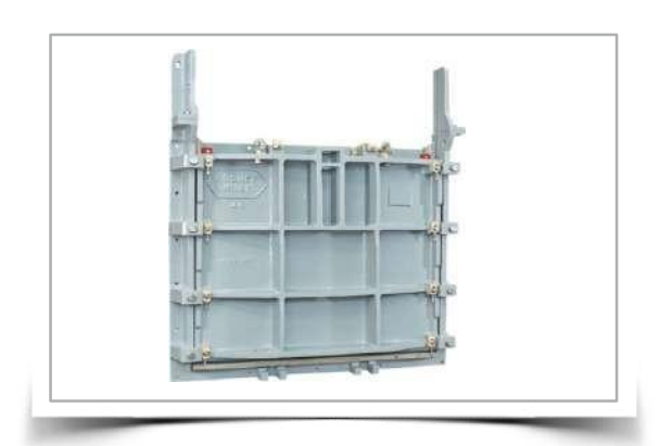
Process Equipment for WTP&WWTP