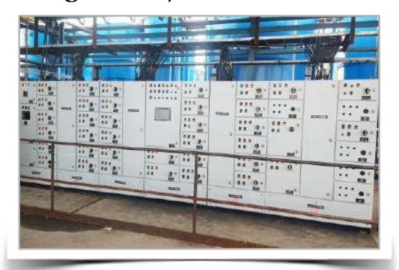
Electrical Control Panels