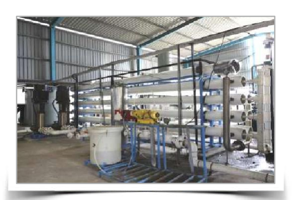
Reverse Osmosis Plant