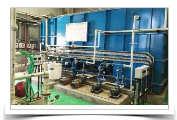
Zero Liquid Discharge Plant