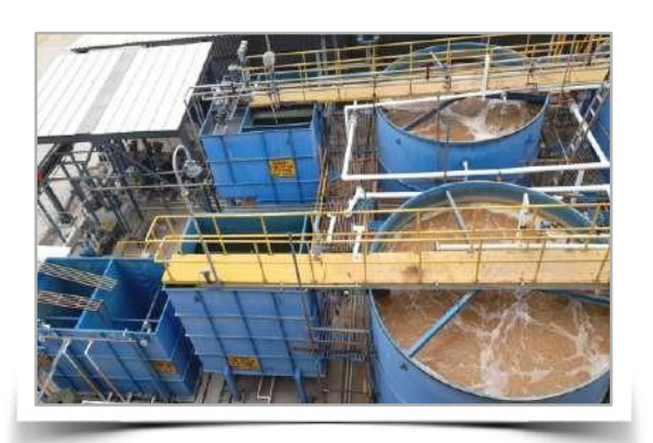
Effluent Treatment Plant