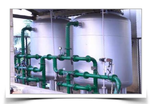
Filtration Plant (PSF/ACF/IRF)