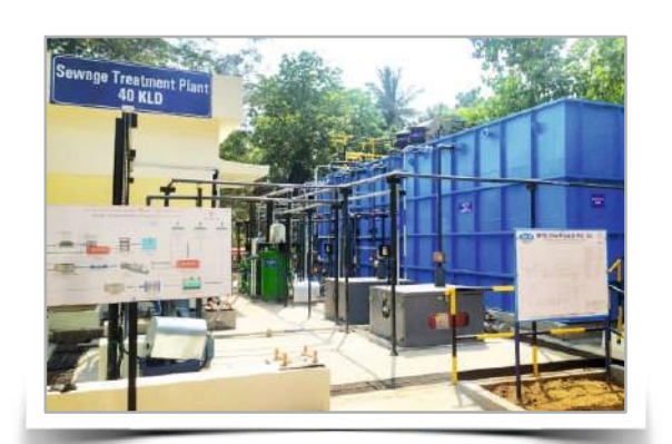
Sewage Treatment Plant