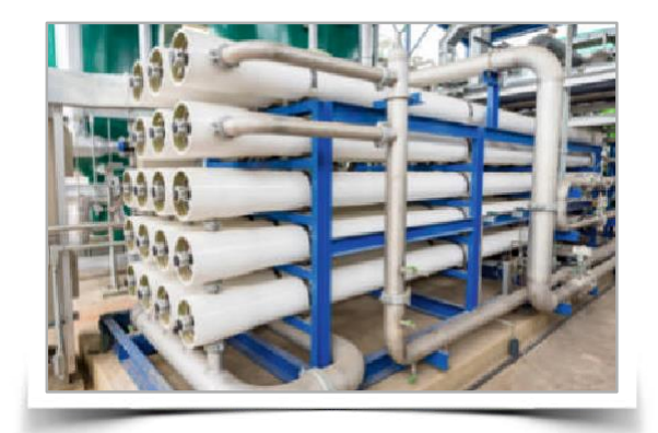
Sea Water Desalination Plant