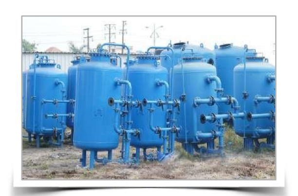
Surge Vessel/Fabricated Tanks